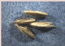
Poa alpina seed ~ 1,307,205 seeds per pound

Note: Alpine bluegrass does not perform well when planted with annual ryegrass.