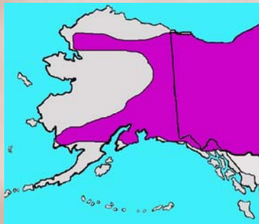
Map from Hultén, 1968. Used with the permission of Stanford University Press.

'Gruening' is extremely winter hardy with early maturation of seed (Wright, 1991).