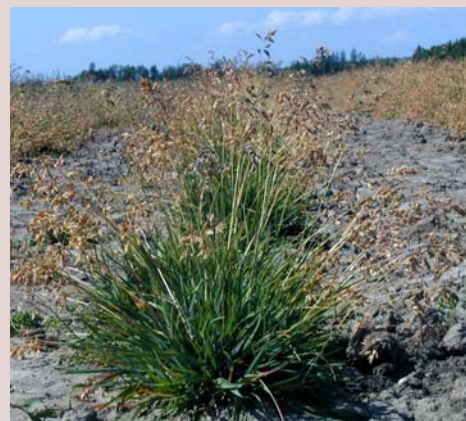
Production field of the 'Gruening' Alpine Bluegrass at the Plant Materials Center in Palmer, Alaska.